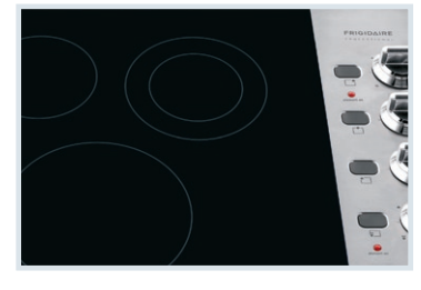
SpaceWise<sup>™</sup> Expandable Elements Elements expand from five to seven inches to fit your cooking needs.